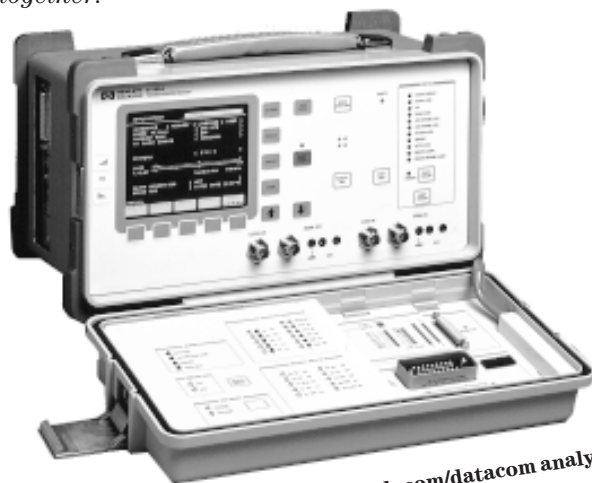
HP 37732A telecom/datacom analyzer

Option W30: 2-year extended hardware support beyond the standard 3-year return-to-bench warranty.