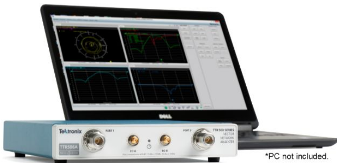
*PC not included.

An independent RF source and three RF receivers for each port of the TTR500 enable you to take high-accuracy magnitude and phase measurements with a 1-port or 2-port device under test (DUT). Use the TTR500 to perform complete S_{11} , S_{12} , S_{21} , and S_{22} measurements of the DUT and display data in a variety of formats (see measurement functionality table).