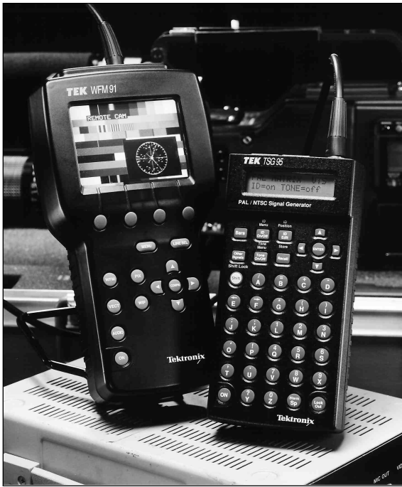
The Tektronix TSG 95 is an ideal companion for the WFM 90 Series Waveform/Vector/Picture/Audio Monitors.