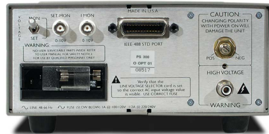
PS350 rear panel (with opt. 01)