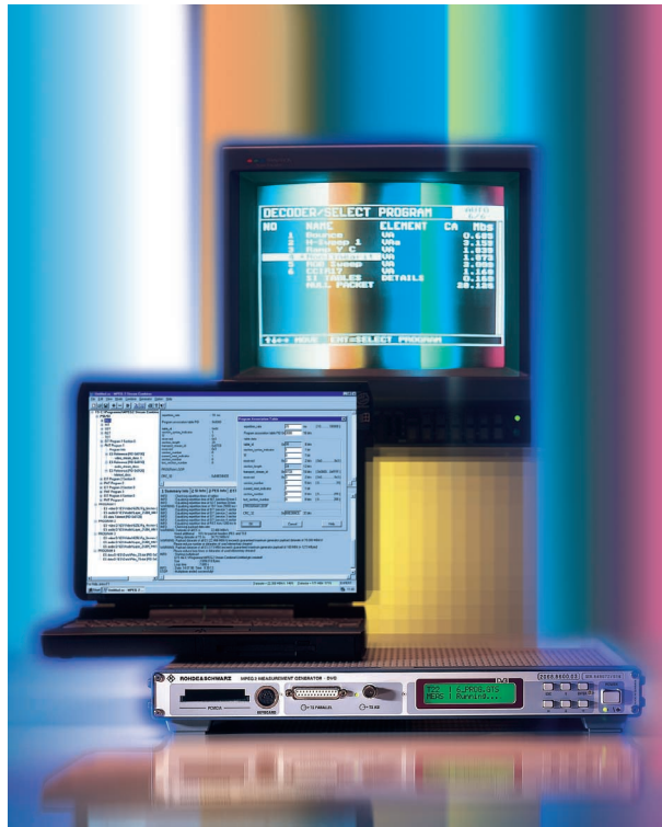
Application-specific transport stream generation with optional PC software Stream Combiner™ DVG-B1

Complementary to Generator DVG, Rohde&Schwarz offers MPEG2 Measurement Decoder DVMD (data sheet PD 757.2744), which is used for real-time monitoring, analyzing and decoding of MPEG2 transport streams.