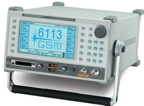
6113 Digital Radio Test Set

Test Sequence mode allows the user to run a complete sequence of single tests using only one or two keystrokes, allowing controlled and repeatable testing.