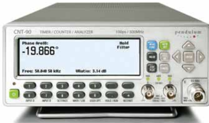
Figure 1: Display showing phase value, frequency, attenuation Va/Vb, and auxiliary parameters.

When adjusting a frequency source to given limits, the graphic display gives fast and accurate visual calibration guidance.