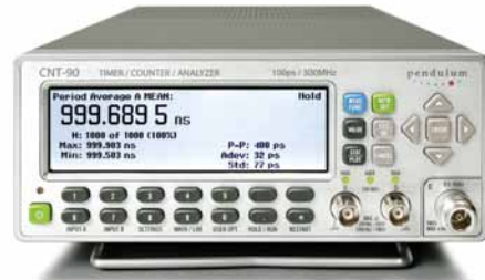
Figure 4: Display showing different statistical parameters viewed at the same time.