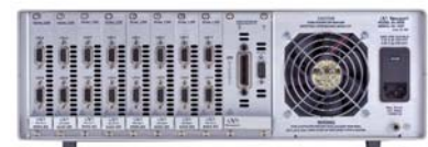
Model 8008 Rear Panel

GPB/IEEE-488 and RS-232 interfaces are included with the Model 8008 for complete remote control and data collection. LabVIEW drivers are supplied with each 8008 mainframe. Automated testing and device evaluation are easily implemented using Newport's extensive library of LabVIEW commands.