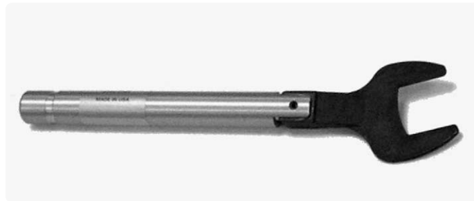
Agilent 20mm torque wrench 8710-1764

The APC-3.5 (m) connector used on the SNS Series of noise sources has an extra-large nut to make it easier to tighten without applying torque to the noise source body. A 20 mm torque wrench is also available from Agilent for this application. Please contact your local Agilent representative for ordering information.