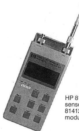
HP 8140A with 81401A sensor module and 81412A LED source module