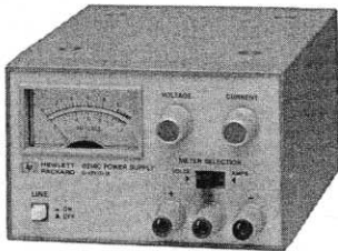
Single Output: HP 6212C-6218C