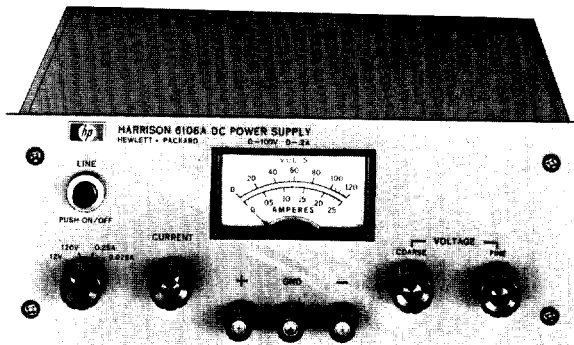
Models 6101A - 6106A