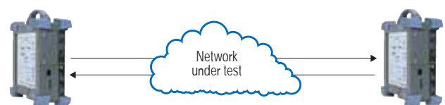
■ Dual-test-set configuration (arrows show direction of traffic).

This tool lists all client-configured routers identified between the local and the destination IP address, within a given delay. When link routers respond to the ping command, the route and statistics are collected by the local module from these replies. Results collected include the IP address of routers in the link and the response delay, round-trip time measurement and a count of frames sent and received. The user also has the ability to configure the parameters of the trace route.