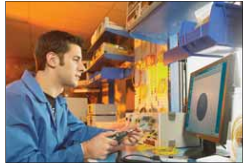
Patchcord inspection in a manufacturing environment