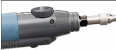
Magnification and focus controls

Thanks to EXFO's FIP-400 Fiber Inspection Probe, checking connectors and other fiber terminations for polish quality and cleanliness has never been easier. Benefit from the best optical resolution in the industry and see scratches and dirt particles as small as 1 µm.