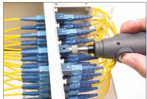
Patch panel bulkhead inspection