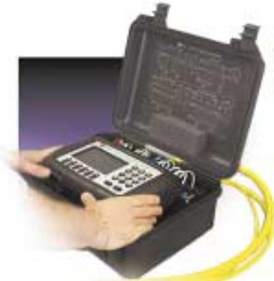
The optional, lockable, NEMA 4x case allows the use of the PP4300 in harsh environments.

Volts, Amps, Watts, VA, VAR, Power factor, Frequency, Voltage unbalance Current crest factor, Demand, Energy, Harmonic directivity, V&I total harmonic distortion, K Factor, Nth harmonics