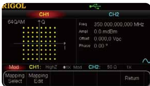
IQ Mapping Selection