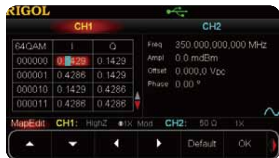
IQ Mapping Edit