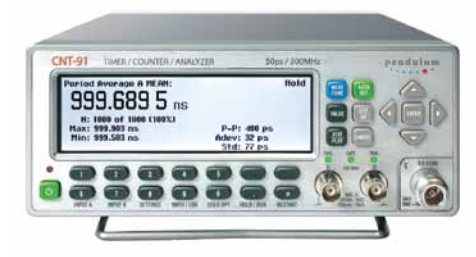
Figure 4: Display showing different statistical parameters viewed at the same time.