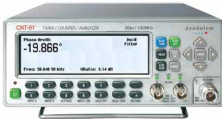
Figure 1: Display showing phase value, frequency, attenuation Va/Vb, and auxiliary parameters.