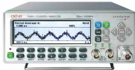
Figure 5: Display showing the trend (signal over time) of sampled data.