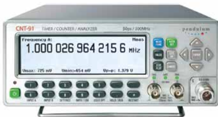
Figure 3: Input parameter setting menu shown with measured result.