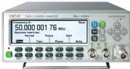
Figure 2: Measure function selection menu, shown with measured results.