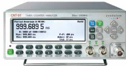
Figure 4: Display showing different statistical parameters viewed at the same time.