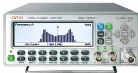
Figure 6: The same result as in Figure 5, now displayed as a histogram.