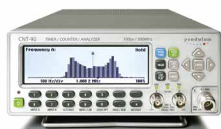
Figure 6: The same result as in Figure 5, now displayed as a histogram.