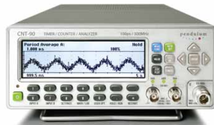
Figure 5: Display showing the trend (signal over time) of sampled data.