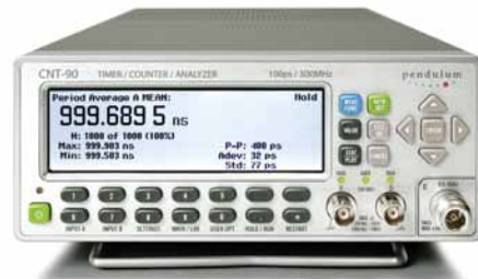
Figure 4: Display showing different statistical parameters viewed at the same time.