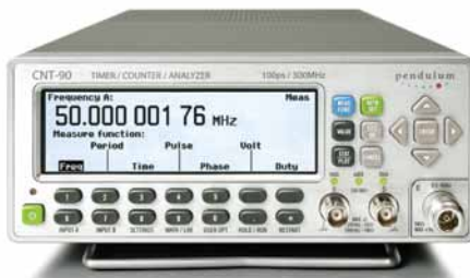
Figure 2: Measure function selection menu, shown with measured results.