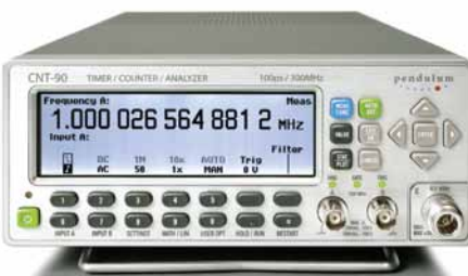
Figure 3: Input parameter setting menu shown with measured result.