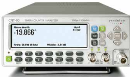
Figure 1: Display showing phase value, frequency, attenuation Va/Vb, and auxiliary parameters.

When adjusting a frequency source to given limits, the graphic display gives fast and accurate visual calibration guidance.