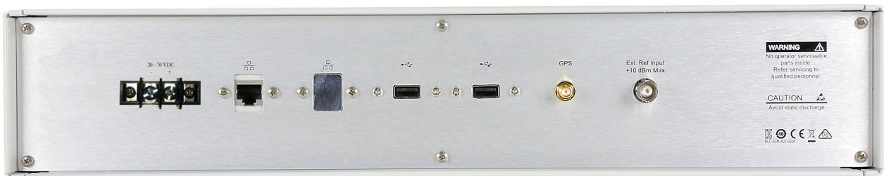
MS27103A Remote Spectrum Monitor (front and rear sides shown, Option 110 replaces screw terminal with 3-pin AC line receptacle)