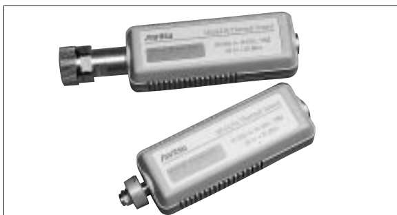
New power sensor technology achieves industry leading measurement linearity and high sensitivity.

The 90 dB range MA2470A Series Power Sensors' high sensitivity reaches stable power readings to -70 dBm. 35 kHz sample rates profile cellular, PCS and other pulsed signals to 0.1 \mu sec resolution. Modern connector technology achieves industry leading return loss for improved accuracy through 50 GHz. The 87 dB range MA2440A Series High Accuracy Sensors further improve return loss performance by adding a matching circuit to the MA2470A Series' front