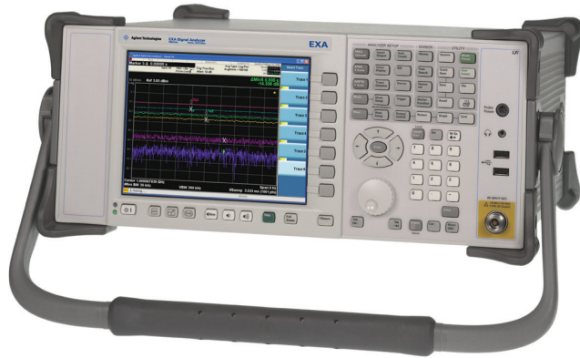
Portable configuration includes pivoting carrying handle and protective corner rubber guards (front protective cover comes standard) – N9010A-PRC