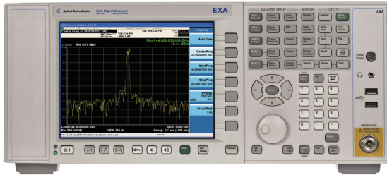
EXA bench top configuration