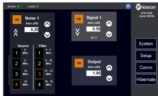
Custom filter control menu