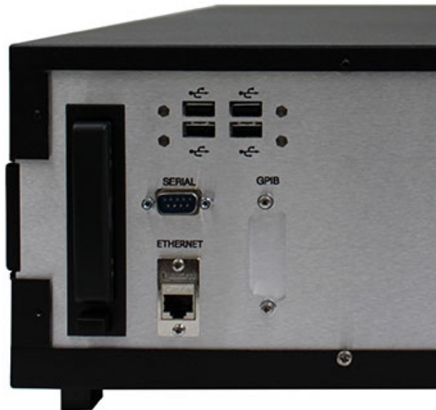
Rear panel removable drive and input/output connectivity