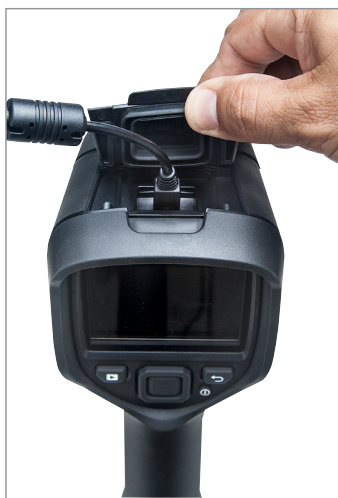
Download images fast via USB.

Specifications are subject to change without notice. For the most up-to-date specifications, go to www.flir.com