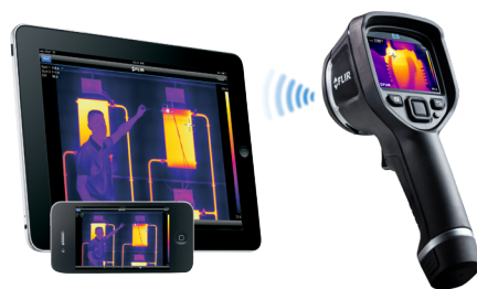
Wireless connectivity to smartphones, tablets and more.

*After product registration on www.flir.com