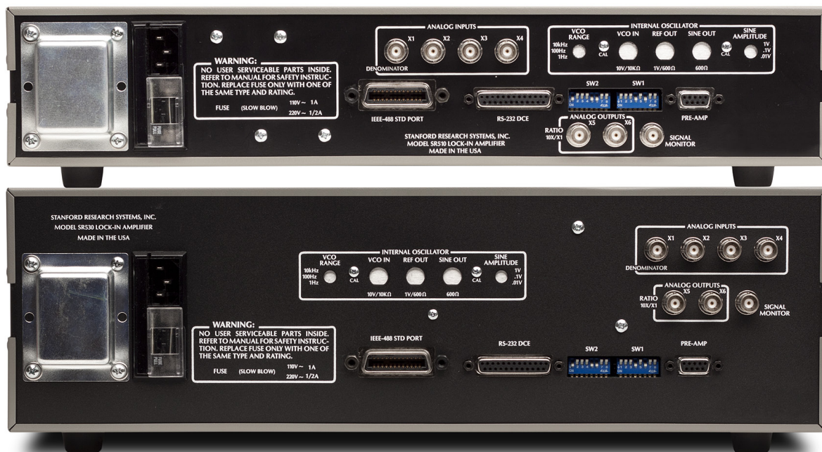
SR510 and SR530 rear panels (with Opt. 01 & Opt. 02)