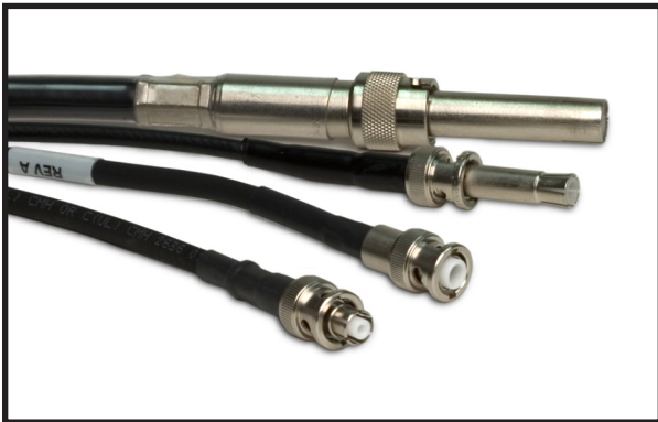
High voltage cables

The PS300 Series High Voltage Power Supplies are as useful in the R&D lab as they are in automated test applications. Wherever you are using them, the PS300 Series provide proven reliability and performance at a very affordable price.