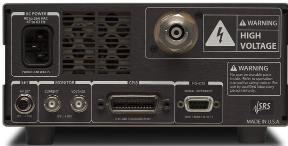
PS370 rear panel

Both GPIB and RS-232 computer interfaces are standard on all 10 W supplies. GPIB is available as an option on the 25 W instruments. All parameters can be set and read via the computer interfaces.