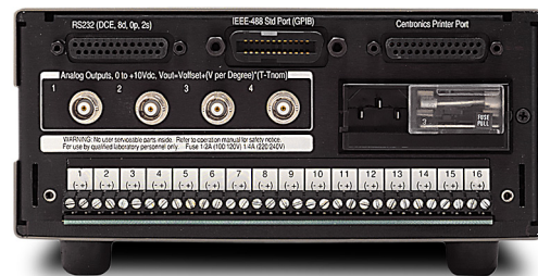
SR630 rear panel